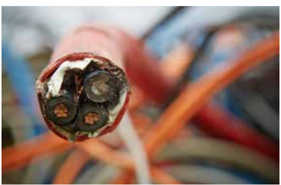
Old cables For example:

Electrical wiring from renovation work and households in general, with and without plugs