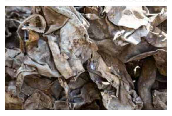
Lead scrap For example: